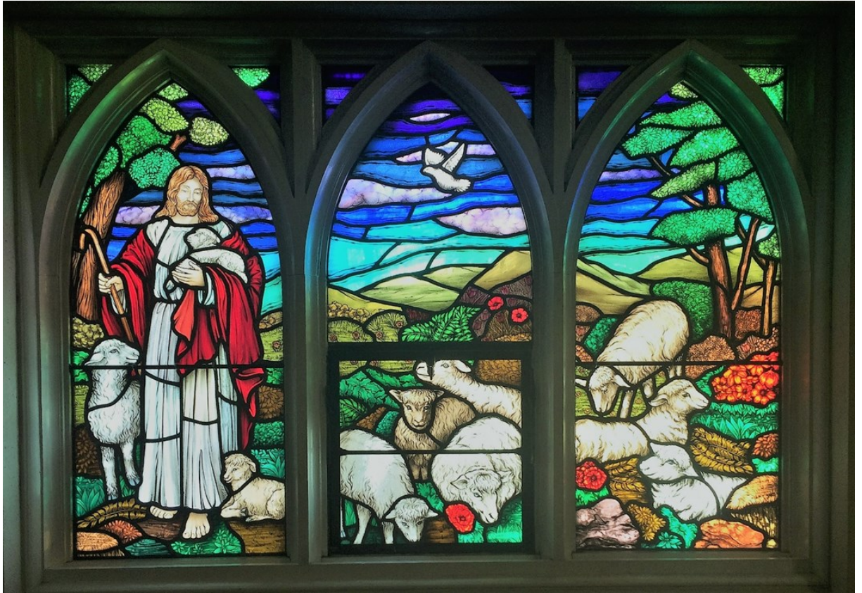
Dedication of the Good Shepherd Window